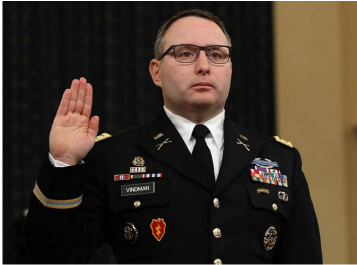
Lt. Col. Alexander Vindman was essentially stripped of his job at the National Security Council for complying with a subpoena to testify before the House Intelligence Committee