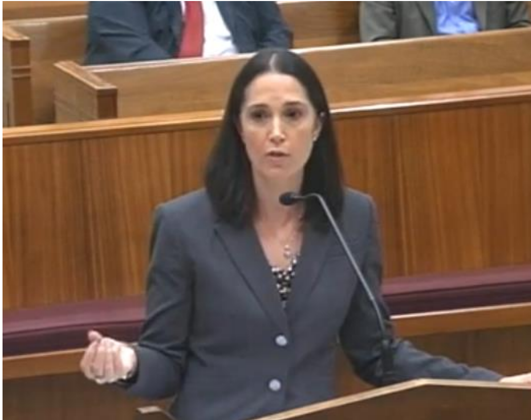
Arguing before the Florida Supreme Court in 2014