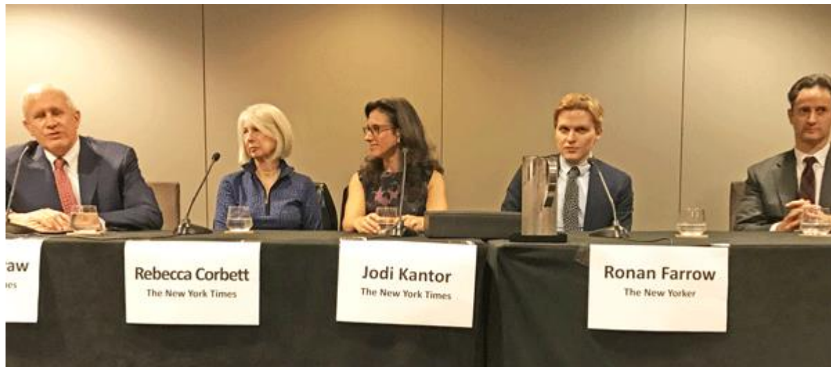
Jodi Kantor and Ronan Farrow with their lawyers and editors at the 2018 MLRC Forum