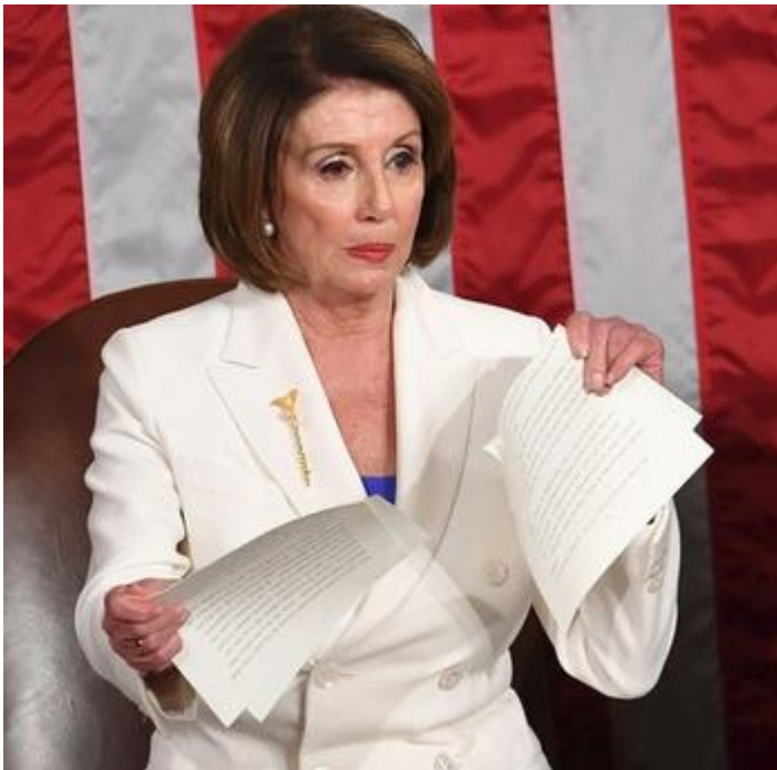
A doctored and misleading video of speaker Pelosi, ripping up a speech she called "a manifesto of mistruths," was retweeted to millions by Trump.

The month started with his peculiar State of the Union address, capped by Speaker Pelosi's provocative ripping up of the text of the speech at its