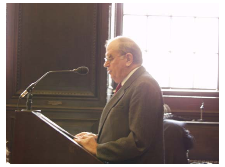
ECHR Judge Loukis Loucaides.

Judge Loucaides concluded by noting that the Court would give wide latitude to the press to report on the private behavior of public officials and political candidates where their conduct impacts the functions of government. But he suggested that publication of "flashy news" – presumably gossip and celebrity